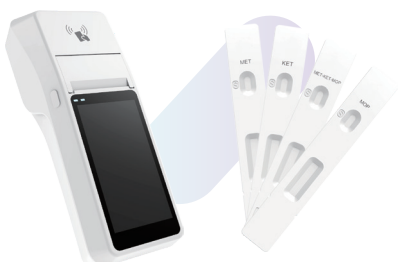
Hair Drug Test