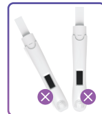
Fig.5 Never hold the test with the absorbent tip pointing upwards after sample addition