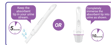
Fig.2 Test in urine stream