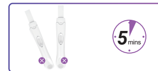
Fig.4 Never hold the test midstream with the absorbent tip pointing upwards.